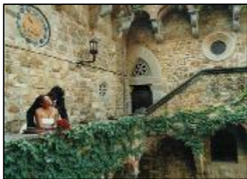
European Romance Starting from $3,295.00