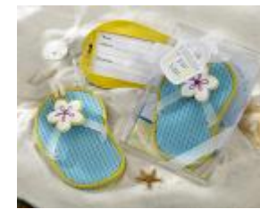
Flip Flop Luggage Tags