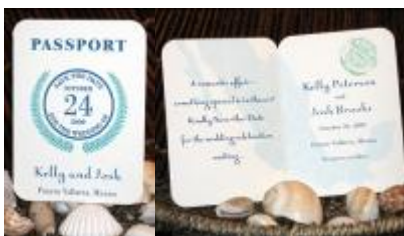
Passport "Save The Date" Invite