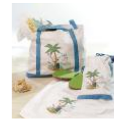
Let The Fun Begin Gift Set