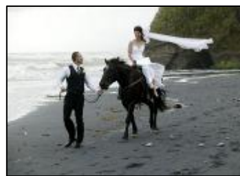
Horseback Riding Romance Starting from $2,595.00