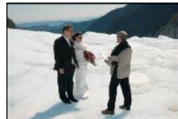
Glacier Romance Starting from $4,595.00