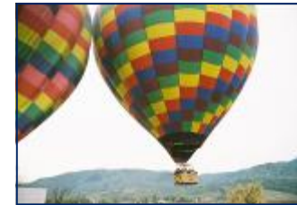
Hot Air Balloon Romance Starting from $4,295.00