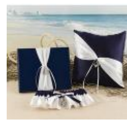
Anchors Away Ceremony Set