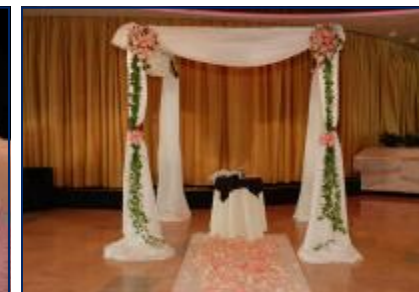
Upgraded Ceremony Arrangements